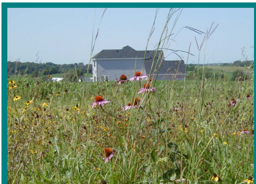
Native Grass Planting