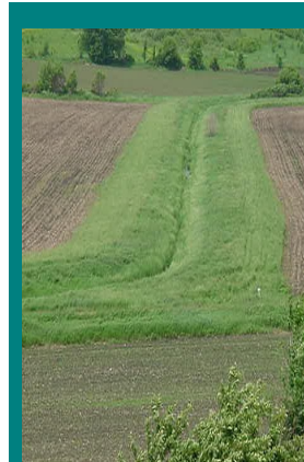
Grassed Filter Strip

Incentive payments are provided to landowners for installing or implementing conservation practices. State or Federal programs are often combined to maximize incentives available to landowners.