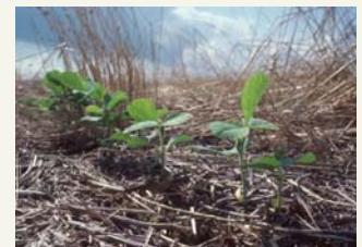
Soybeans planted in residue cover

The cost to rent the drills will depend on the land location within in Scott County and the amount of residue remaining after planting. Contact the office for rental rates and drop charges if they apply.